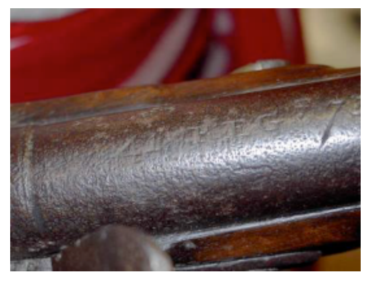
A gem - An India Pattern Brown Bess, issued in 1806, with 41st Regt. markings on it.

Build a positive, comfortable routine and you will live a healthier life and will find yourself ready for the demands of the events of our season.